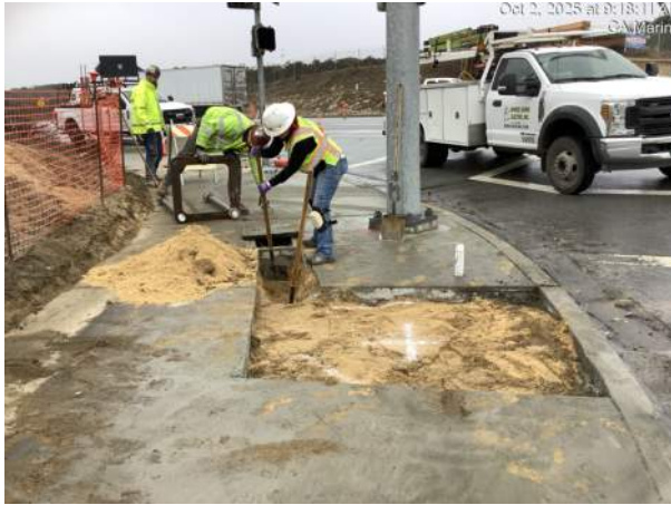
Demo sidewalk for access to drill foundation