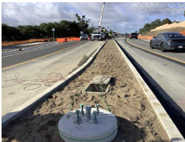
Median streetlight foundation in the foreground. Crew standing another streetlight in the background