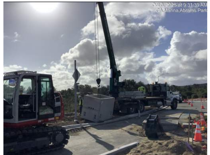
PG&E contractor off-loading one of their new equipment vaults