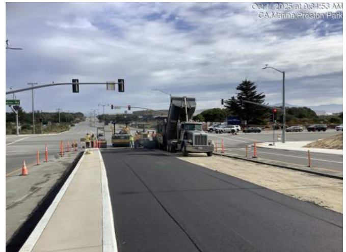
Paving first layer of asphalt along Imjin Parkway near Reservation Road