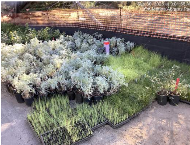
New delivery of native plant materials