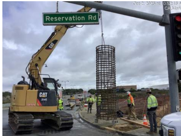
Reinforcing steel cage to be lowered into drilled hole