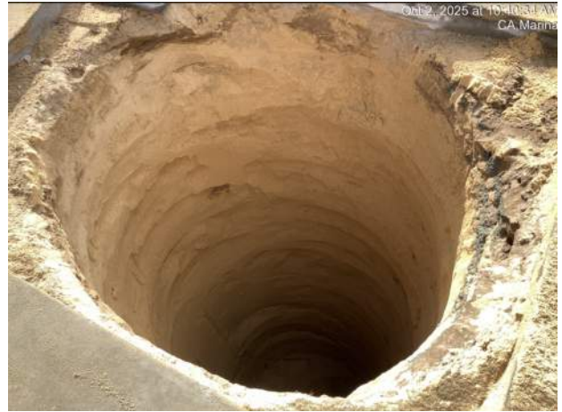
Drilled hole (4'-6" diameter, 15' deep)