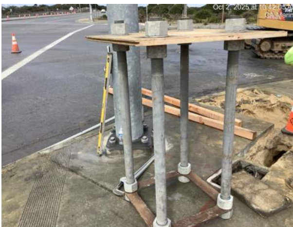
Anchor bolts (3" diameter, 5' long) will be set inside the reinforcing steel cage