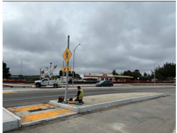
Wiring work for rapid flashing beacon equipment at pedestrian crossings