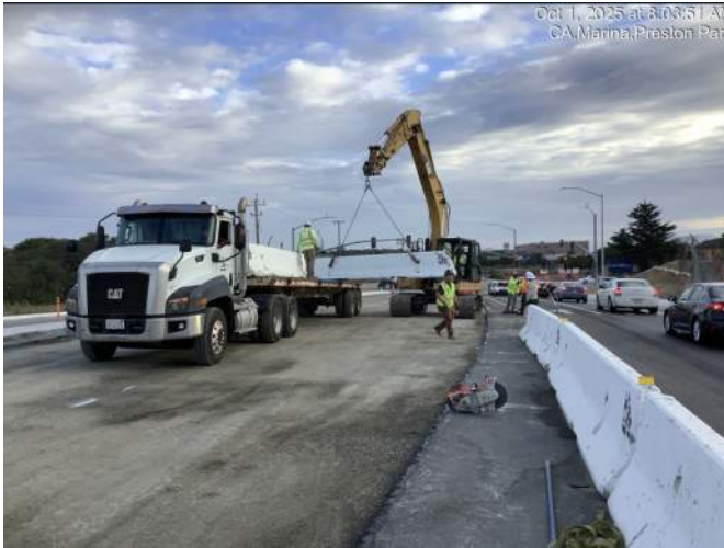
Removing concrete barriers along Imjin Parkway near Reservation Road