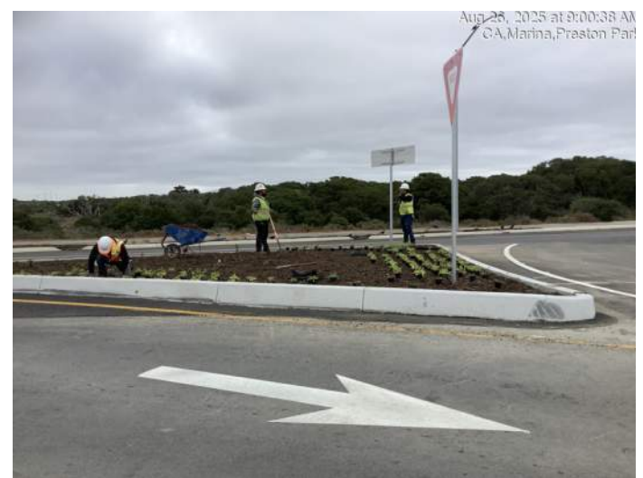
Tree and native plants near Preston Drive