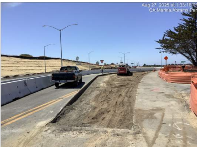
Marina Heights Drive

Rough grading of areas where temporary pavement was removed