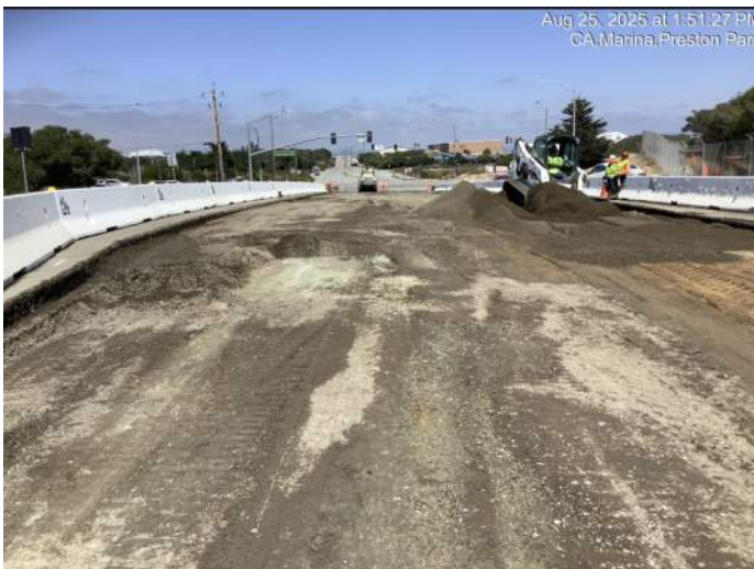
Near Reservation Road