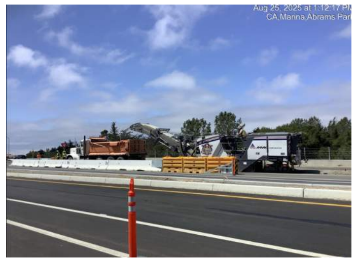
Grinding and removing temporary pavement near Reservation Road (left) and Abrams Drive (right)