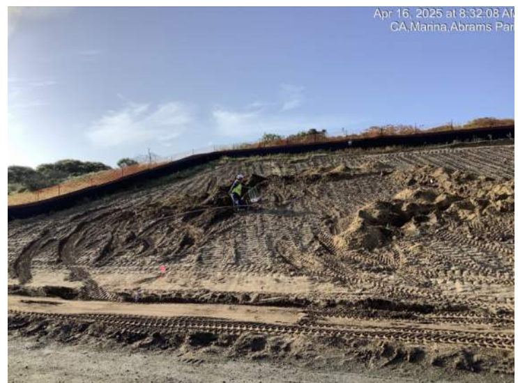
Installing irrigation service lines for irrigation (during plant establishment period)