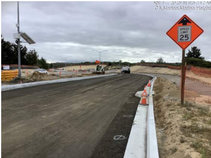
Final grading/base rock at Imjin Road