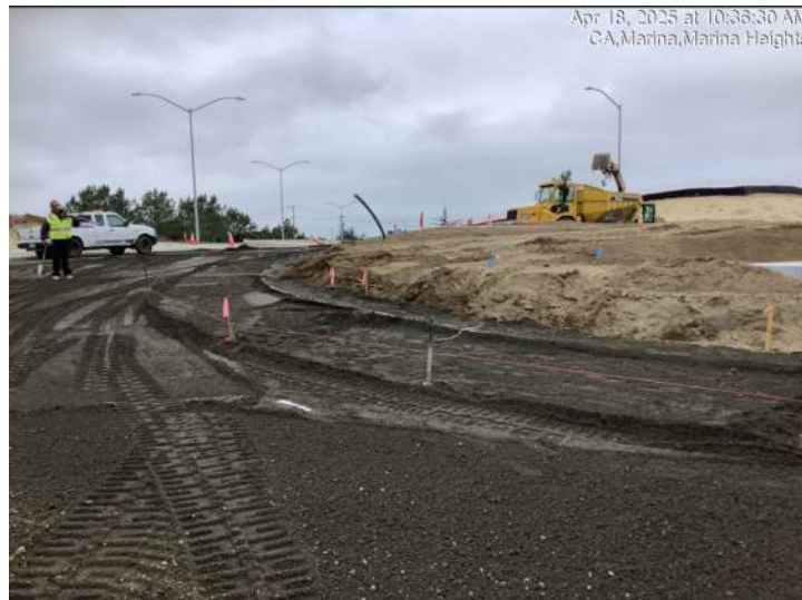
Roadway grading at Marina Heights Drive roundabout