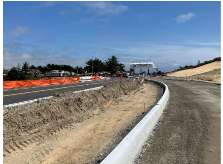
Final grading and base rock for south side roadway between Imjin Road and Marina Heights Drive