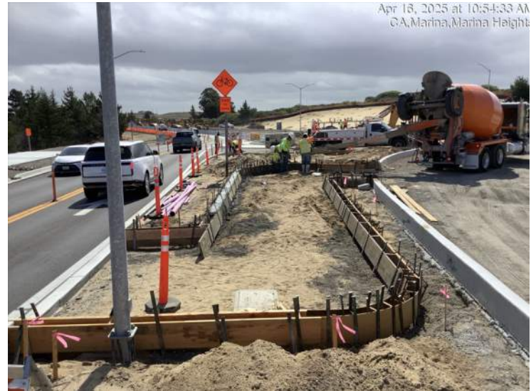
Forming for curb and sidewalk near Imjin Road