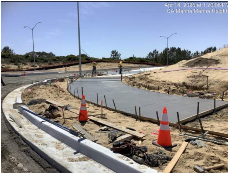
Concrete for sidewalk at Imjin Road