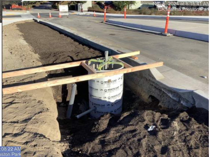
Forming for street light foundation