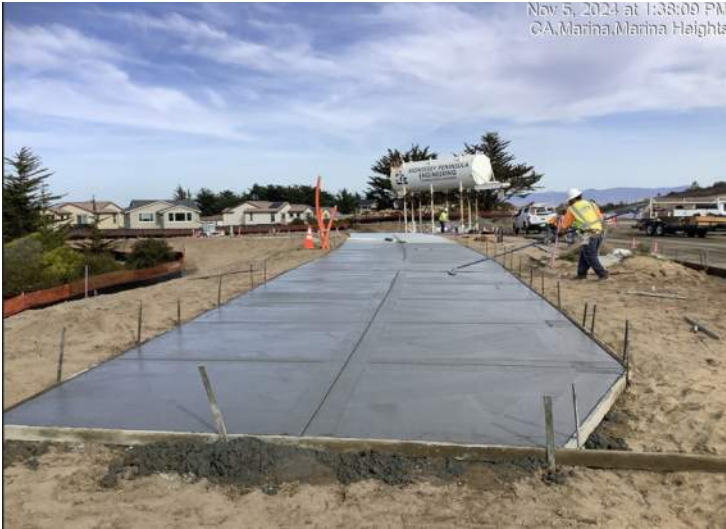
Concrete work for bike/pedestrian path at Marina Heights Drive