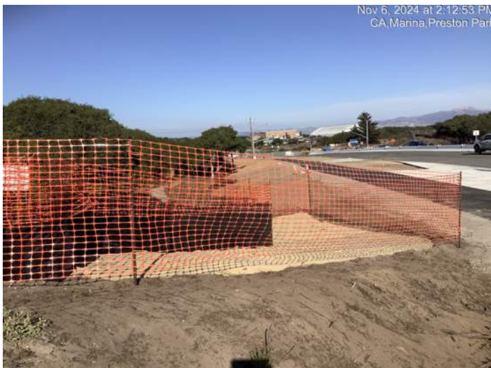
Spineflower seed bank restoration area