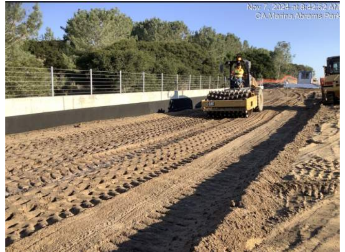
Earthwork at retaining wall near Abrams Drive