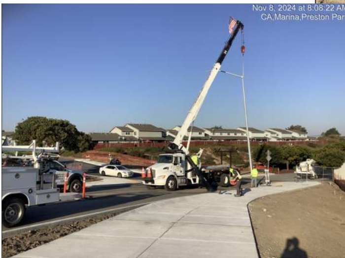
Standing street light pole on foundation