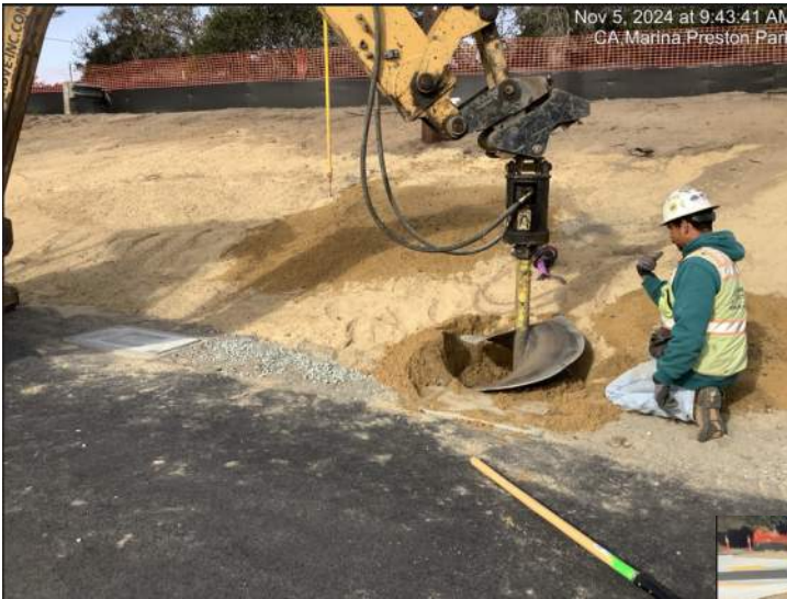
Drilling for street light foundation