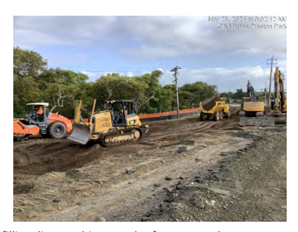
Earthwork operations near Reservation Road - cutting and filling dirt to achieve grades for new roadway