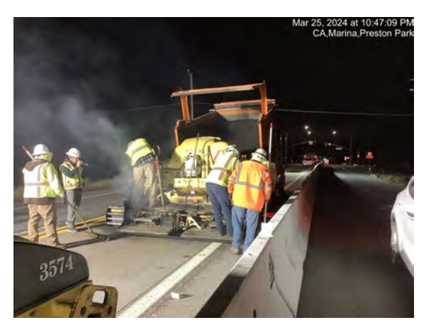
Night work - new pavement in pothole locations