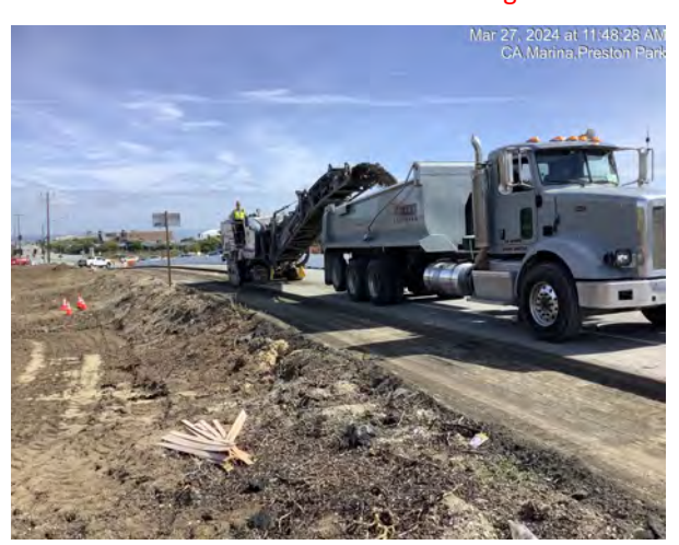
Grinding and removal of old roadway pavement